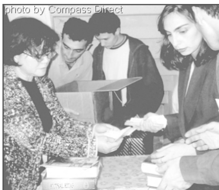
Modern Turkish Bible on sale for first time.

The only previous Turkish Bible in use was a revision of a translation commissioned 335 years ago by